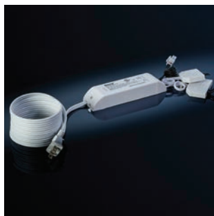
LED Driver, 18W Dimmable (Full Specs on Page #105)