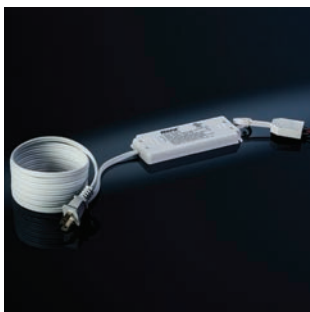
LED Driver, 10W (Full Specs on Page #104)