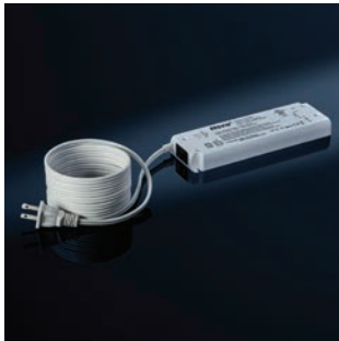
Daisy Driver, 30W (Full Specs on Page #94)