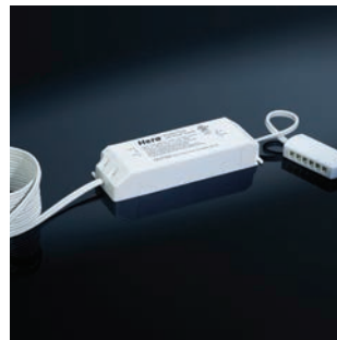
Driver, 75W (Full Specs on Page #100)