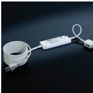
Driver, 6W (Full Specs on Page #98)