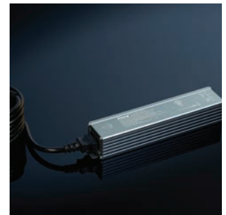
Driver, 96W (Full Specs on Page #101)