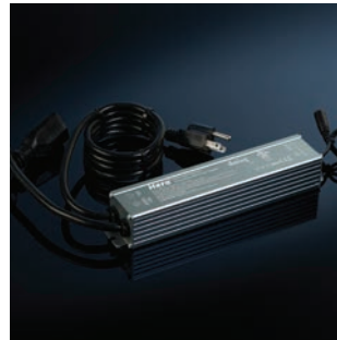
Daisy Driver, 96W (Full Specs on Page #96)