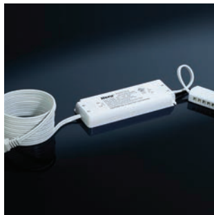
Driver, 30W (Full Specs on Page #99)