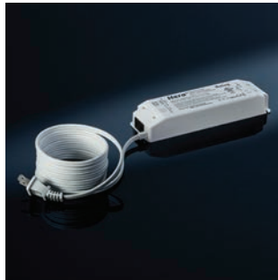
Daisy Driver, 75W (Full Specs on Page #95)