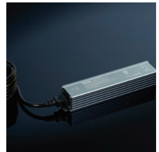
Driver, 96W (Full Specs on Page #101)