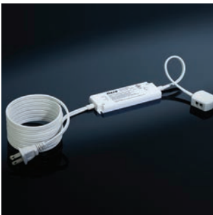
Driver, 6W (Full Specs on Page #98)