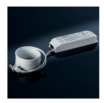
Daisy Driver, 96W (Full Specs on Page #96)