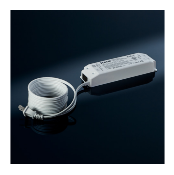
Daisy Driver, 75W (Full Specs on Page #95)