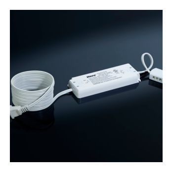
Daisy Driver, 30W (Full Specs on Page #94)