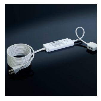
Driver, 6W (Full Specs on Page #98)