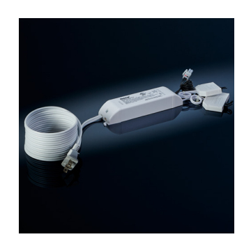
LED Driver, 18W Dimmable (Full Specs on Page #105)