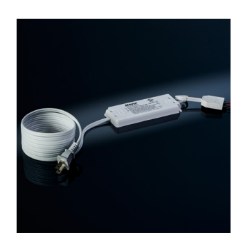
LED Driver, 10W (Full Specs on Page #104)